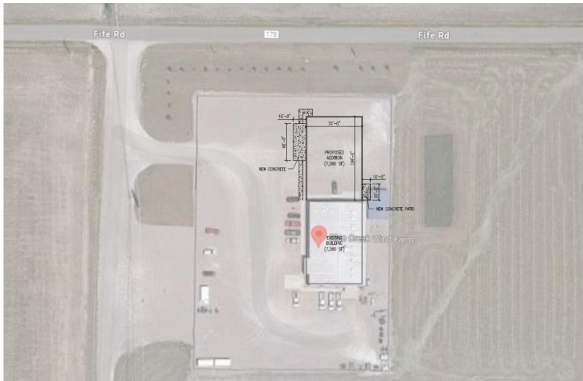
Figure 1. O&M Building Site Plan

This Third Amendment application seeks OPSB approval for a minor modification to the Facility layout through the expansion of the existing O&M building. The proposed expansion is entirely within the existing developed footprint, does not introduce new environmental or operational impacts, and will serve both the Blue Creek Wind Farm and the adjacent Wild Grains Solar Facility.