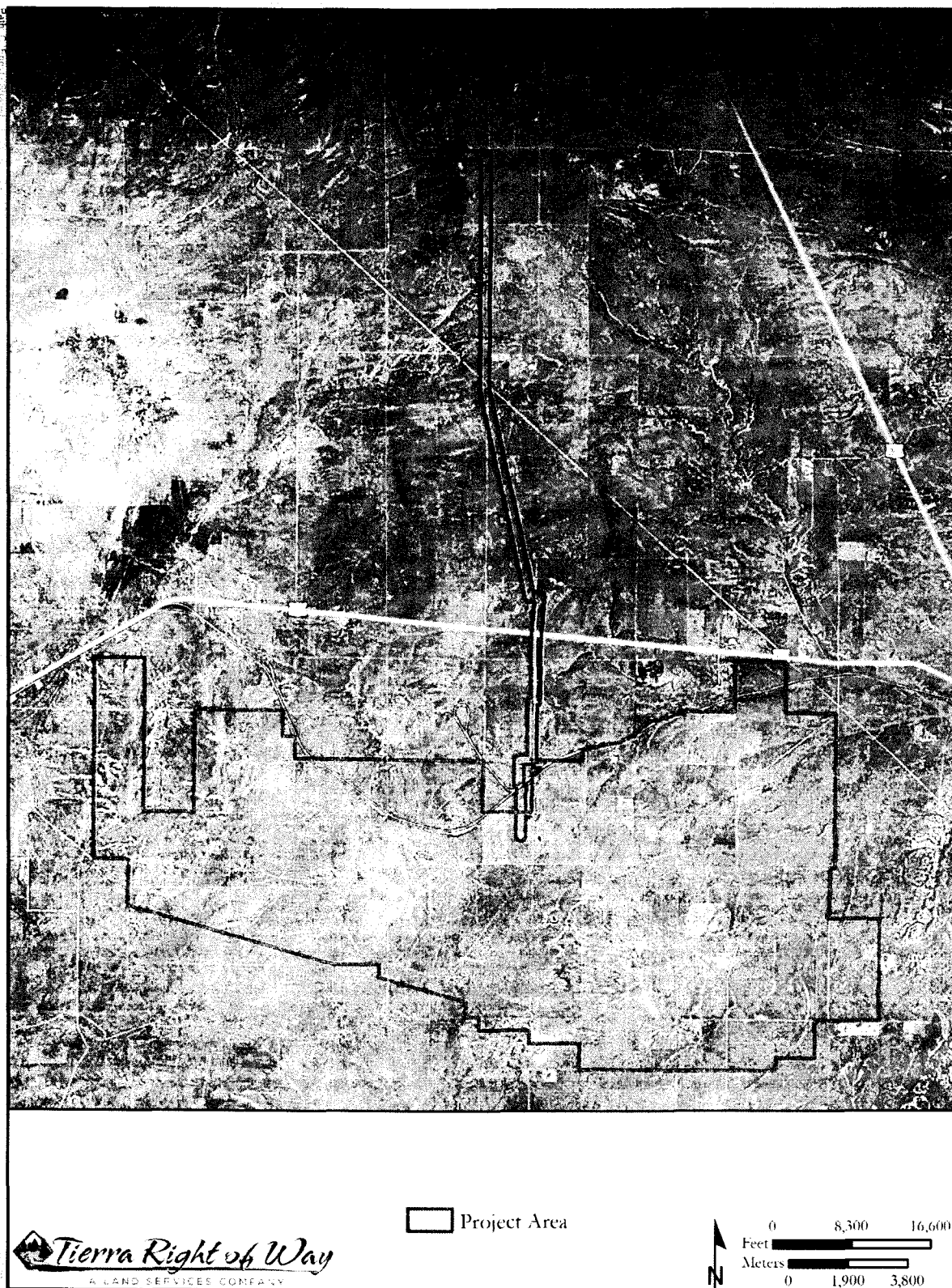
Figure 2. Detailed Project area.