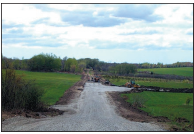
Local and Access Road Upgrades