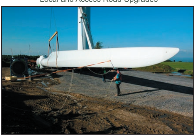
Rotor Blade Assembly