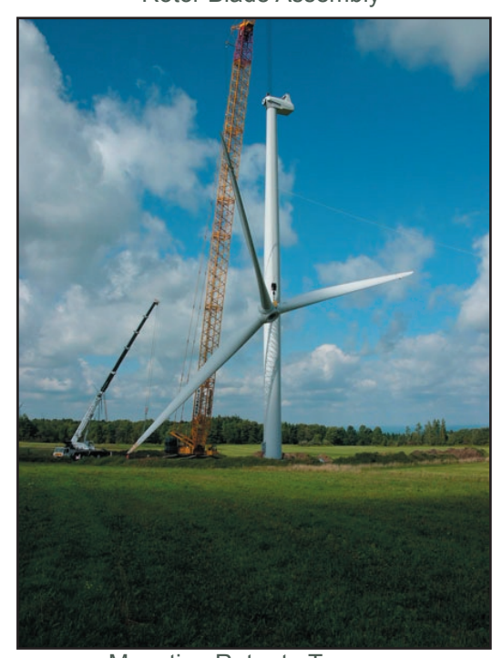
Mounting Rotor to Tower