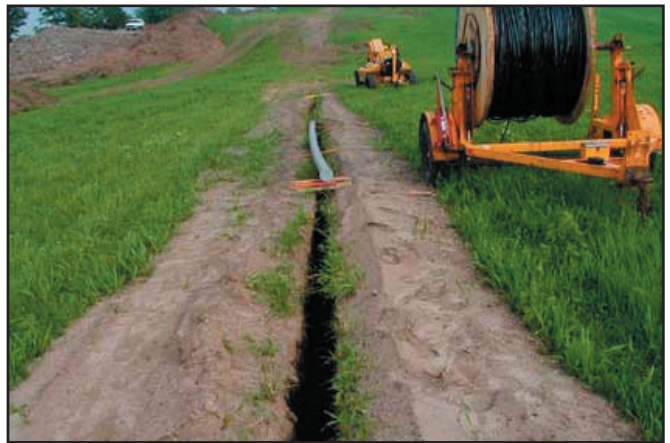
Electrical Line Interconnect