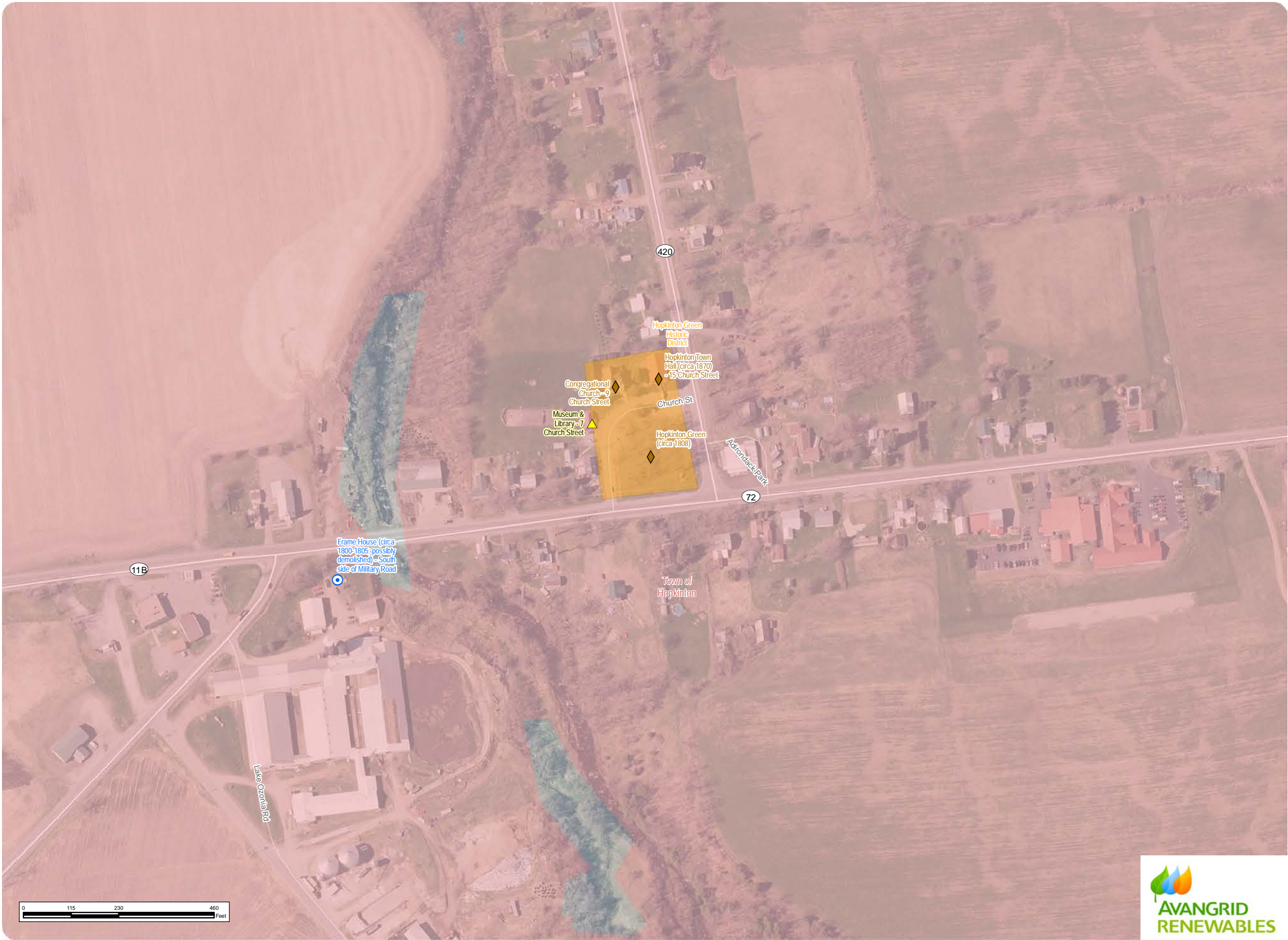
Figure 7: Existing Conditions Sheet 9 of 10

Towns of Hopkinton and Parishville, St. Lawrence County, New York