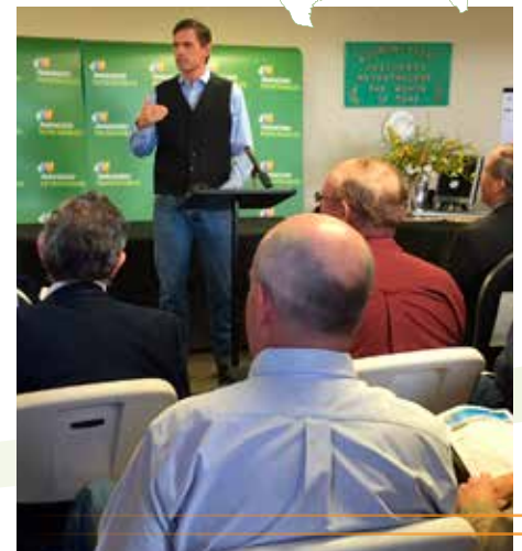
Sen. Martin Heinrich speaks to the crowd during the El Cabo Wind Project construction celebration