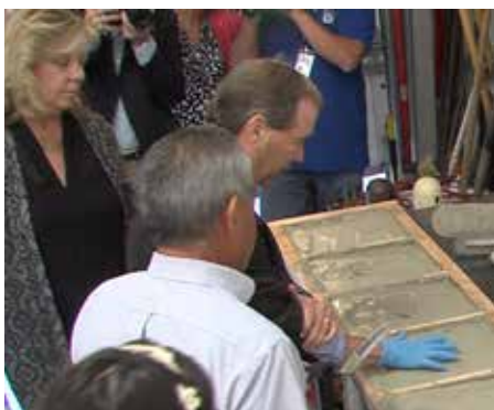
Sen. Tom Udall casts his handprint