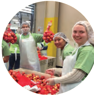
Community Partnerships Helping the most vulnerable people