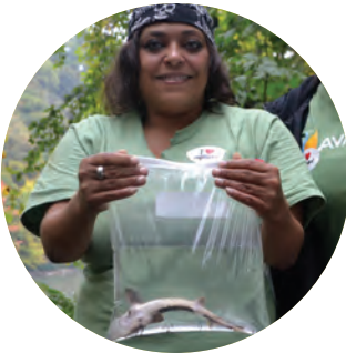
Biodiversity, Environment & Climate Action Protecting the environment, enhancing biodiversity and fighting climate change