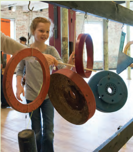
Above: Children in Gunnar Schonbeck