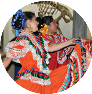
Art & Culture Safeguarding artistic and cultural heritage through conservation, restoration and local development

We are also here to help. Throughout 2017, there was an expanded focus on disaster preparedness and emergency relief for communities affected by natural disaster.