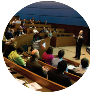
Education, Training & Research Developing leaders and supporting innovation

The roots of the Avangrid Foundation date back to 2002, having been known by other names including the Energy East Foundation and the Iberdrola USA Foundation. Since AVANGRID, Inc. was formed in 2015, the Avangrid Foundation has been working to continue and build on the historic legacy of giving in our communities. In 2017 we developed a strategic roadmap to help use social value and a focus on what really matters – investing in an increasing number of sustainable communities and improving the quality of life for people.